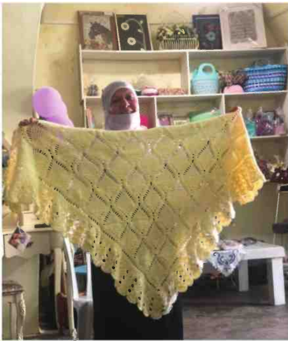
TRADITIONAL EMBROIDERY at Rokmot Hatahara.