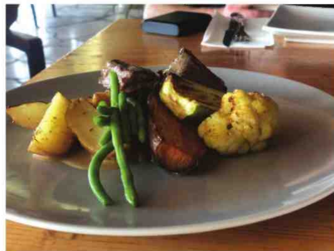
CULINARY DELIGHTS at Adelina.