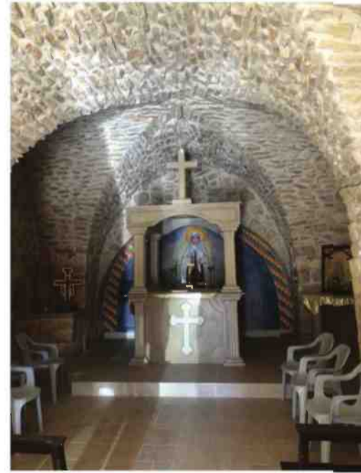
BYZANTINE-ERA church in the Druze town of Hurfeish (left).