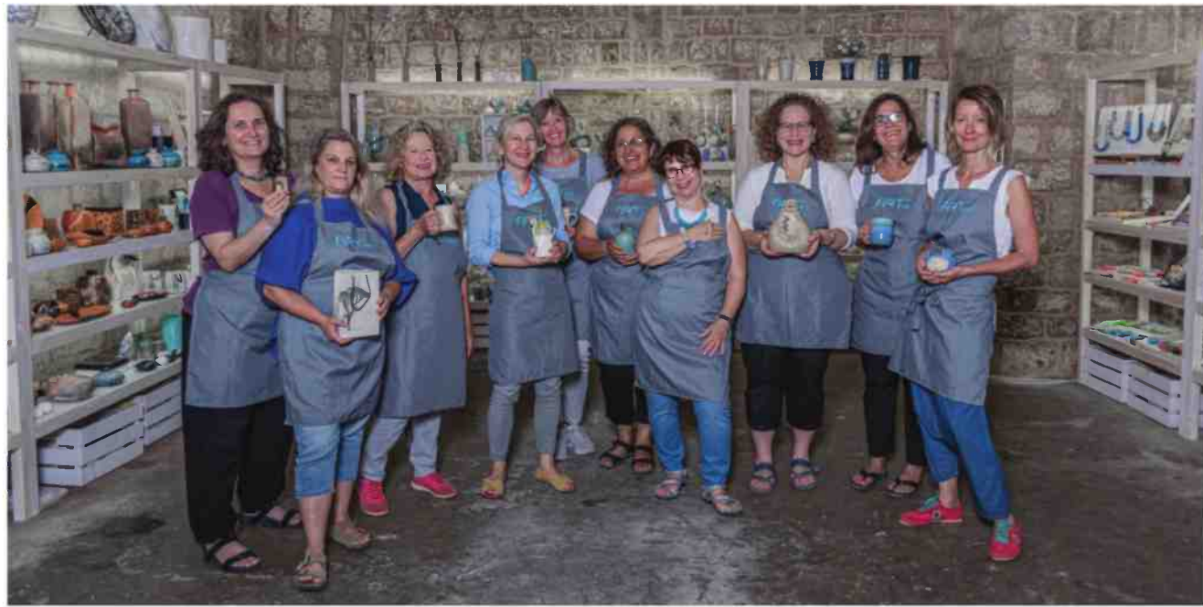
ART ON parade.