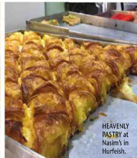
HEAVENLY PASTRY at Nasim's in Hurfeish.